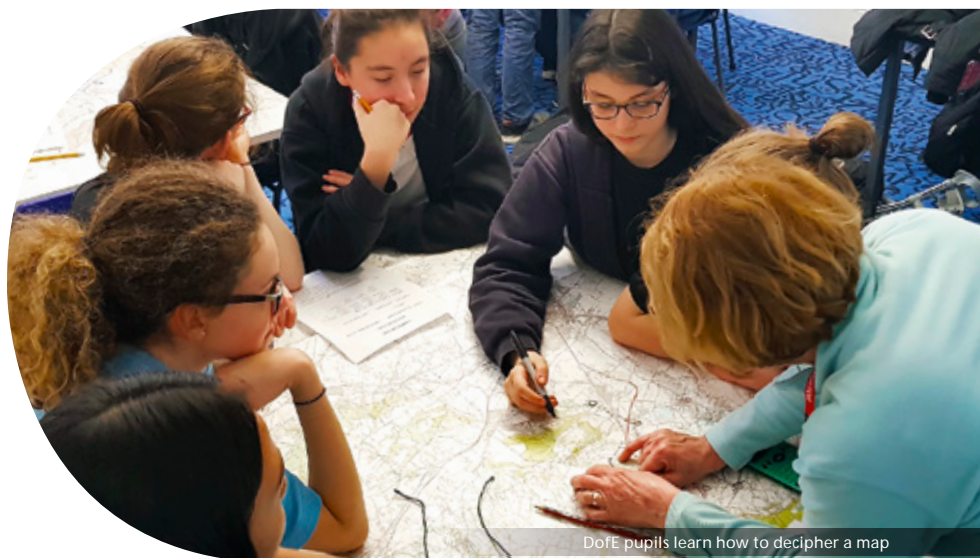
DofE pupils learn how to decipher a map