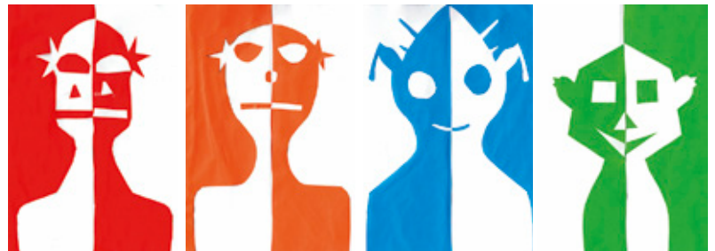
Travaux mêlant art et symétrie.